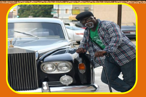
One Man Reflects on the Role Mentoring had on his Life.