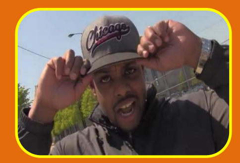
Mentor of Chicago Girl Who Died After Performing for Obama Speaks Out.