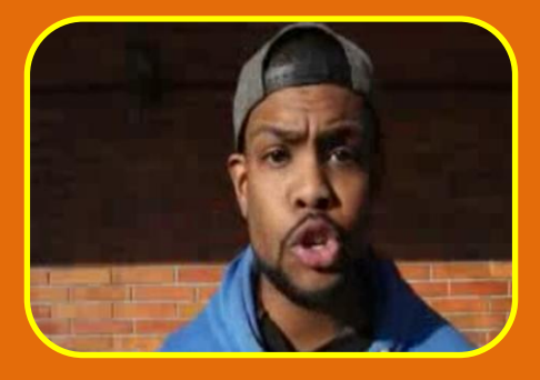
How My Final Suicide Attempt Attracted My First Mentor.