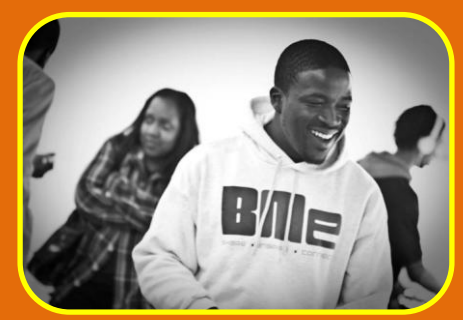
The Truth About Black Male Mentors.