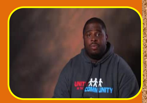
My Mentor Didn't Just Change My Behavior, He Changed How I Think.