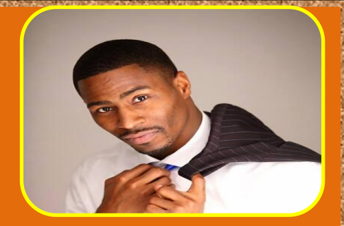
Brutal Honesty: How Being Tormented Made me a Mentor.