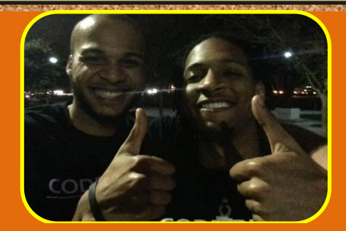
Blessed with a Brother from another Mother.