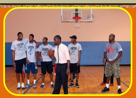
I Coach Because He Coached: Inspired by Men Who Mentor.