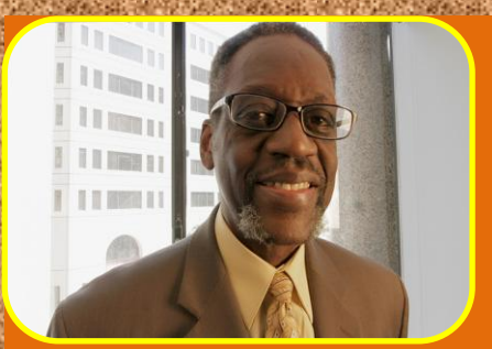
I Rejected the Idea of Being a Mentor, Now I am One.