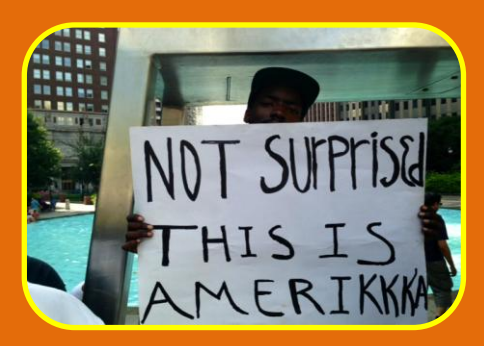
A Speechless Conversation between Mentor and Mentee.