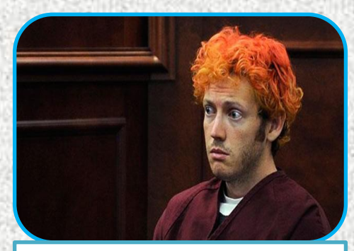
<u>White Men Appear</u> <u>Immune to Stop and</u> <u>Frisk, Not Mass Murders</u>