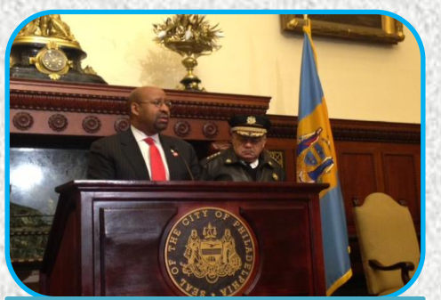
Mayor Warns Youth of Stiff Consequences for Random Violence