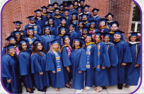
HBCU Launches Effort to Connect & Mobilize Millennial Alumni