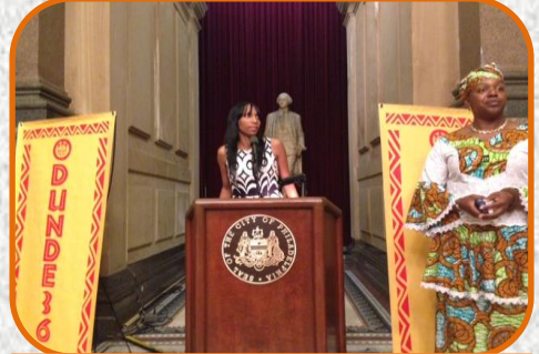
Female CEO Provides Youth with Year-Round Culture